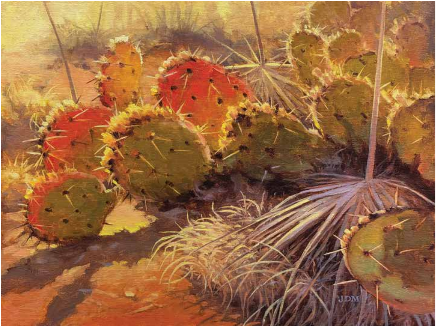
A Sticky Afternoon (oil, 12 x 16 in.) by John Meister

onto the landscape. Plein air painters avoid chasing the light; I also avoid chasing my trash.